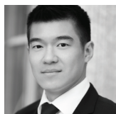
Kevin Chiang Commercial Real Estate & Land Investment

The assembly of over one acre of land in the heart of Coquitlam Town Centre provided an opportunity to secure a potential city block once coupled with neighbouring City of Coquitlam lands to the south. As a rapid transit site, timing and assessing local political will, facilitating the sale of a noncontiguous site for maximum pricing for our clients.