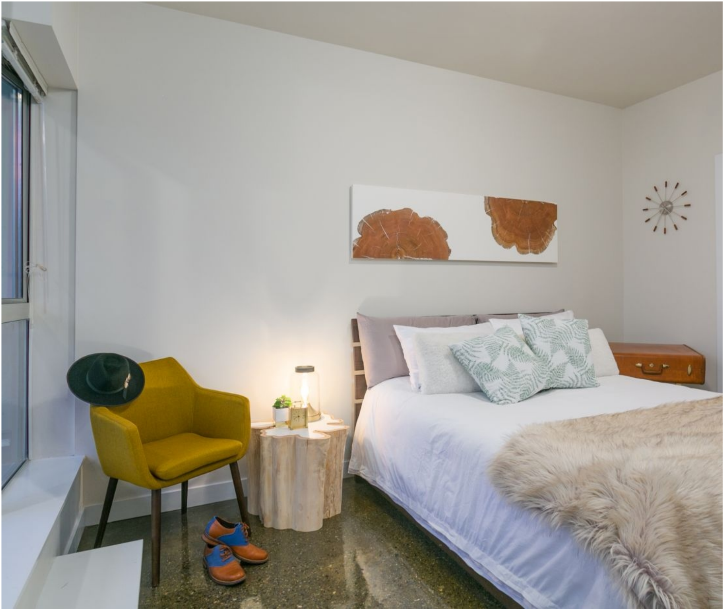
The wood used to make this panel and side table is taken from ground after an area has been logged