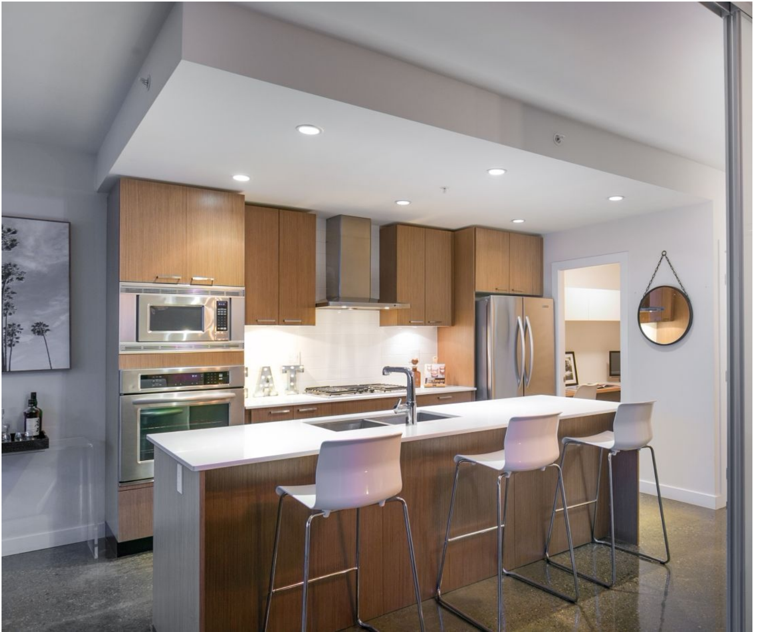
The wooden kitchen cabinets play off the wooden art throughout the home nicely