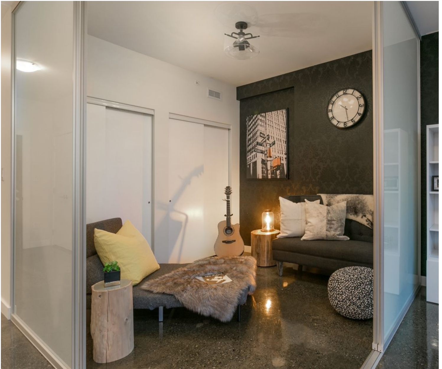
Every piece of Michael's art, like these side tables, is one of a kind