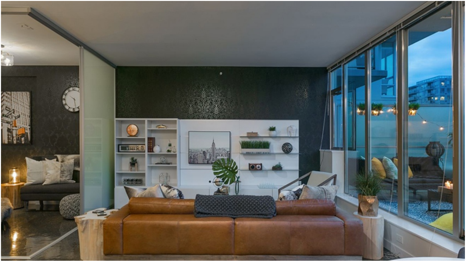
Two of Michael's pieces flank this leather couch, adding an element of natural beauty